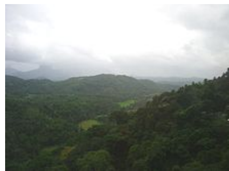
Looking down from the Balana pass.