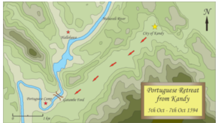
The route taken by the Portuguese on 5 October 1594 is shown with red arrows. Halloluwa village is located several kilometers north of the Portuguese camp, on the west bank of the Mahaveli River