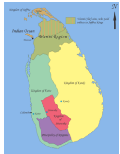
Political map of Sri Lanka soon after the Spoiling of Vijayabahu. In 1538 Sitawaka annexed the Principality of Raigama and gradually captured Kotte territories.

In 1593 Sitawaka Rajasinghe attempted to retake Kandy but his army was defeated at Balana. While returning from the battle he died from an injury caused by a bamboo splinter. On Rajasinghe's death, his general Mannamperuma Mohottila (a Vaduga mercenary leader named Aditta Kee-Vendu Perumal, who had risen in rank by winning the king's favour) deserted to the Portuguese and changed his name to Jayavira Bandara Mudali. With his assistance, the Portuguese conquered Sitawaka in 1594. During the looting of Sitawaka, Jayavira Bandara Mudali managed to secure a vast treasure, making him rich and influential. [20]