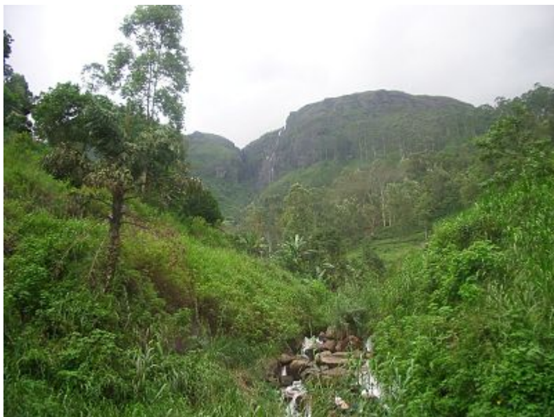
Terrain near Kandy: much of the kingdom was mountainous, thickly forested and devoid of roads; the climate was often cold, with violent winds and rains.

— John Davy, describing the Balana pass in 1821 [35]