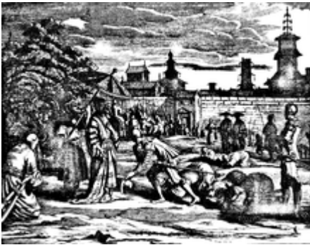
Princess Dona Catarina being welcomed to Kandy by Captain-General Pedro Lopes de Sousa with local princes and chieftains.

Sousa rapidly organized a raiding party, which consisted of a hundred Portuguese soldiers under Francisco da Silva and a large number of Lascarins under Jayavira Bandara. He sent them to Wellassa and Uva in order to capture the King. [1] Additionally he placed a bounty of 10,000 pagodas (equal to 20,000 rixdollars ) on the life of King Vimaladhrmasuriya! [37]