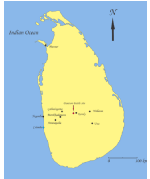
The Danture battle site and other locations important to the campaign.

In June 1594 the Portuguese and Lascarins (now 15,000 strong) marched out from Sitawaka. Their first stop was Attanagalla. After three days they reached Menikkadawara, but the monsoon rains delayed them there for fourteen days. Then they advanced towards Galbodagama (which stood at the site of the current-day Polgahawela railway station), burning and destroying the countryside of Seven Korale. The prince of Seven Korale, uncommitted thus far, became a Christian and declared his allegiance to the Portuguese. [33] Leaving Seven Korale, the army camped in the vicinity of Balana Pass, gateway to the Kingdom of Kandy, to await the princess and the force from Mannar. Once these had arrived, Sousa advanced toward the pass. [33]