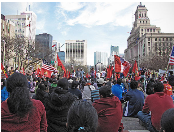
Canadian Tamils block University Avenue, Toronto demonstrating against the Sri Lankan forces.

Main article: 2009 Tamil diaspora protests Tamil diaspora communities around the world protested