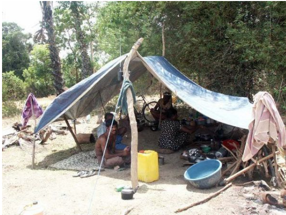
Shelter built from tarp and sticks. Pictured are displaced persons from the civil war in Sri Lanka