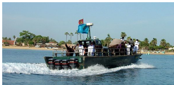
LTTE Sea Tiger boat patrolling during the peace

Following the signing of the ceasefire agreement, com-