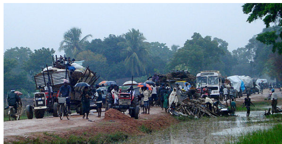
Civilians being displaced as a result of the Sri Lanka Army's military offensive. January 2009.

The Sri Lankan Army began the attack on Kilinochchi on 23 November 2008. Troops were attacking rebels' defences from three directions. [200] However, the LTTE offered a stiff resistance, and the prolonged attack resulted in heavy casualties on both sides. [201]