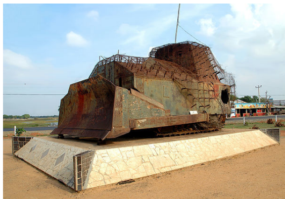
Improvised armored bulldozer used by the LTTE in the First Battle of Elephant Pass (1991), one of the major battles. Today, the disabled armored bulldozer stands on display as a war memorial.

demands were not met, the Provincial Council would go ahead with a unilateral declaration of independence of the Northern and Eastern provinces, as in the case of Rhodesia. [66][67] President Premadasa moved to quickly dissolve the Council (March 1990). At the same time, LTTE used terror tactics to scare Sinhalese and Muslim farmers away from the North and East of the island, and swiftly took control of a significant portion of the territory. When the Indian Peace-Keeping Force withdrew in 1989–1990, the LTTE established many government-like functions in the areas under its control. A tentative ceasefire held in 1990 as the LTTE occupied itself with destroying rival Tamil groups while the government cracked down on the JVP uprising. When both major combatants had established their power bases, they turned on each other and the ceasefire broke down. The government launched an offensive to try to retake Jaffna.